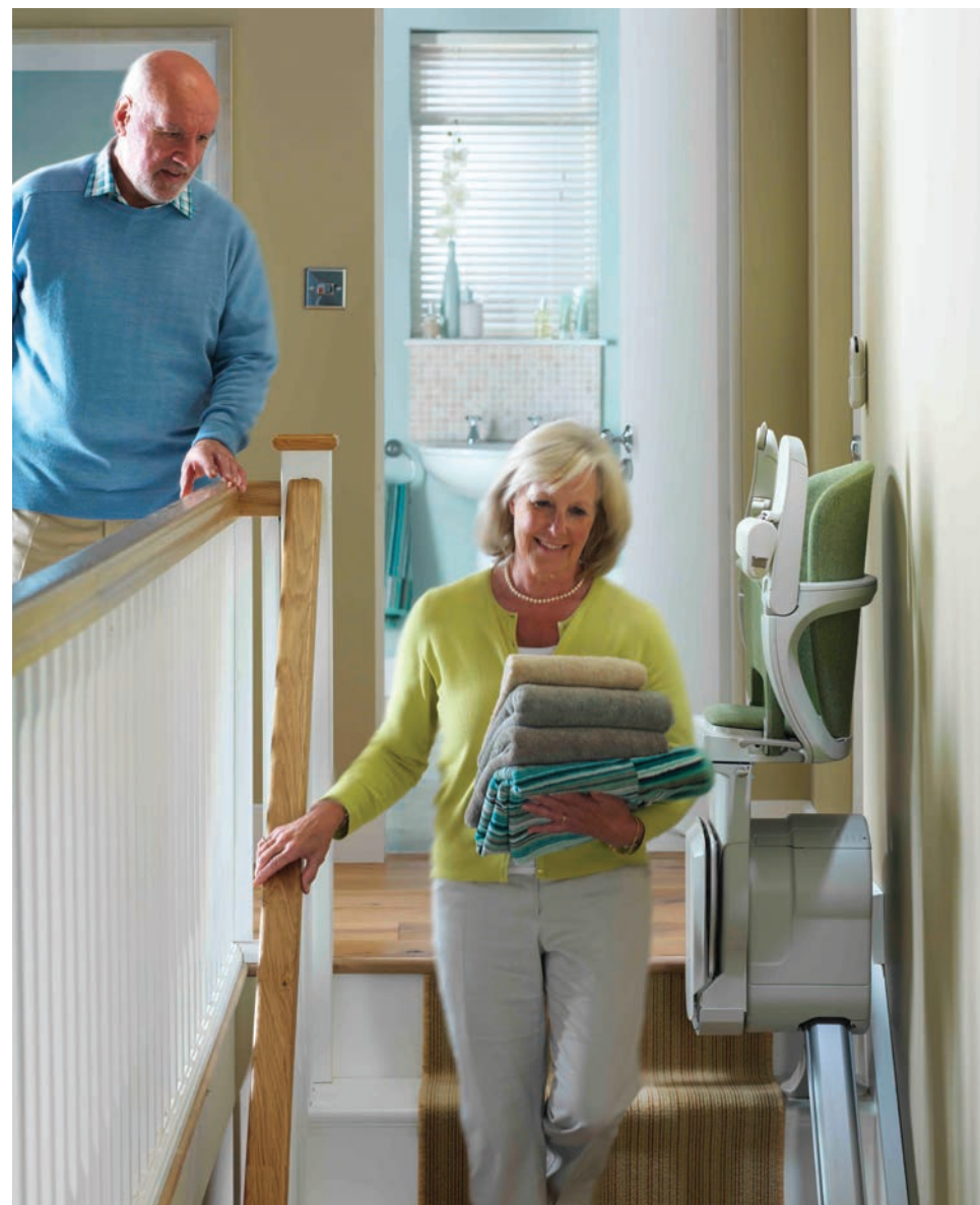
The Starla's slimline design allows others to still use the stairs

Tailor it to your tastes and home by choosing a fabric, with or without a light or dark wood finish or select the full vinyl upholstery in a range of sophisticated colours.