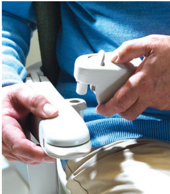
Seatbelt can be fastened with one hand

Effortless and simple. This sums up beautifully just how much thought and care we have designed into each and every function of our Starla stairlift. From the safe and easy-to-use seatbelts, to stairlifts that take up minimal space on your staircase, we have made your Starla stairlift simple, safe and reliable.