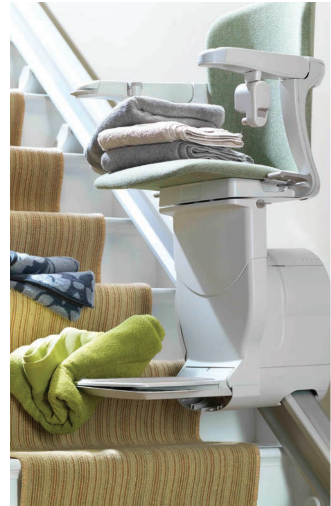
Sensors detect any obstructions on your stairs

"We are delighted with the stairlift. My wife enjoys the ride. It gives her independence. She finds it very easy to use"