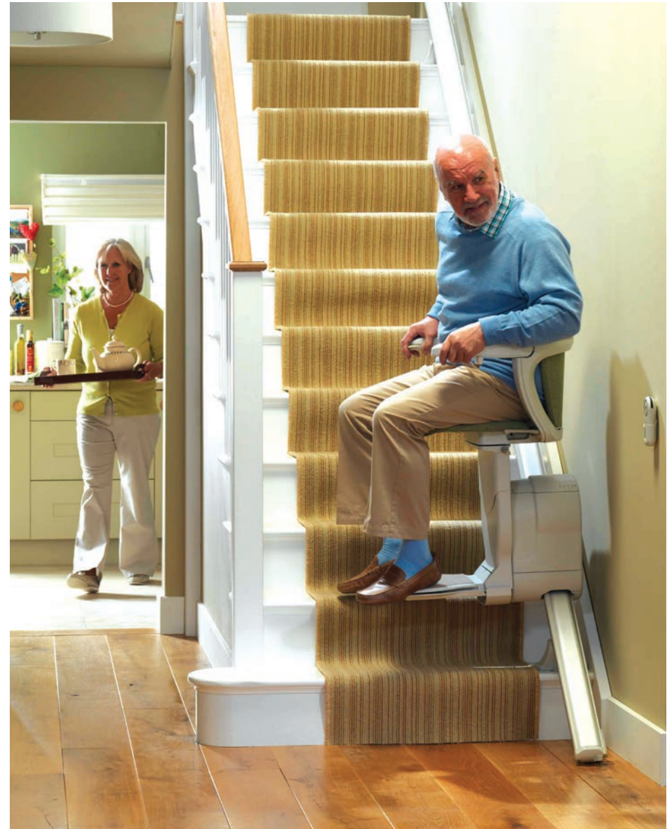
A gentle touch of the controls is all it takes to climb your stairs