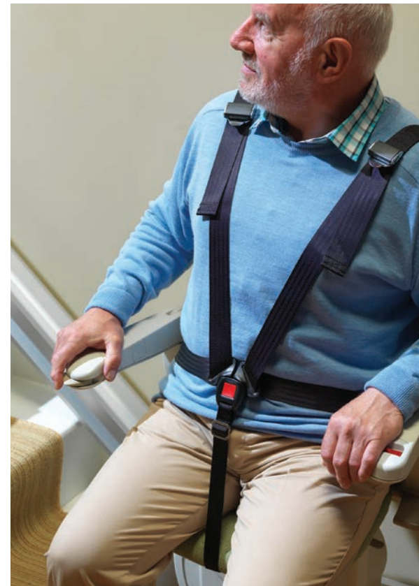
Five point harness