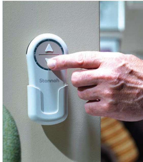
Use the wall control to call your Starla