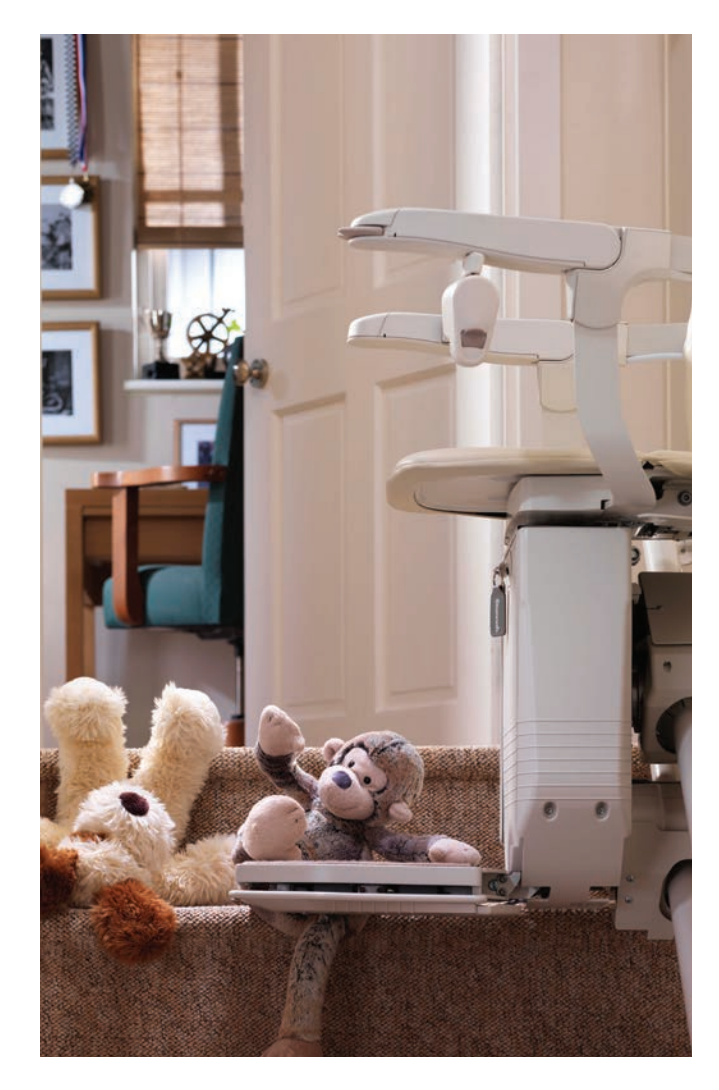
Seatbelt can be fastened with one hand The Siena folds neatly away when not in use Sensors detect