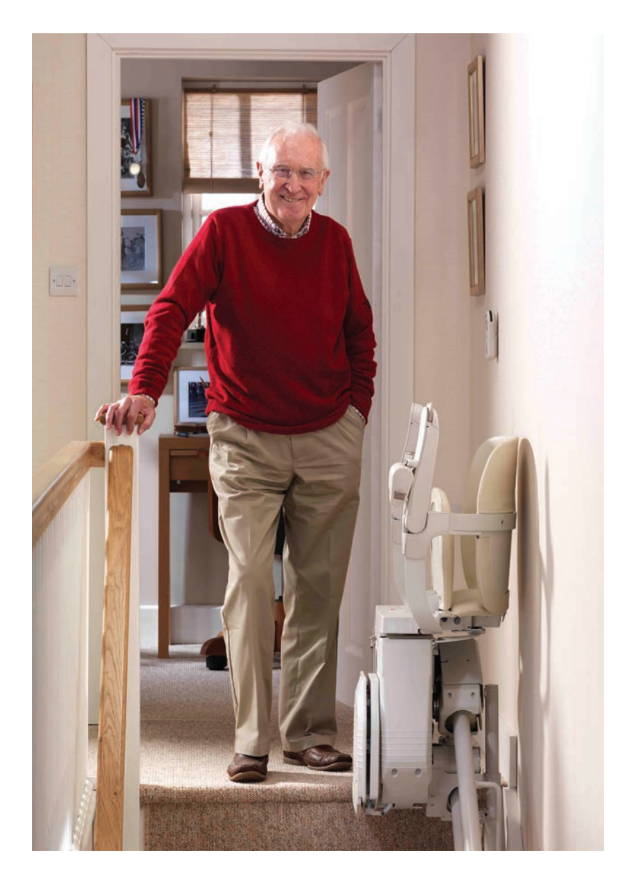
The Siena's slimline design allows others to still use the stairs

The Siena also comes in two chair widths allowing you to pick the one most comfortable for you, your home and your life.