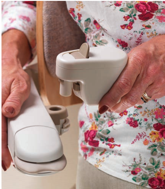
Seatbelt can be fastened with one hand

Effortless and simple. This sums up beautifully just how much thought and care we have designed into each and every function of our Sadler stairlift. From the safe and easy-to-use seatbelts, to stairlifts that fit on either side of the stairs and on all types of staircases, we have made your Sadler stairlift simple, safe and reliable.