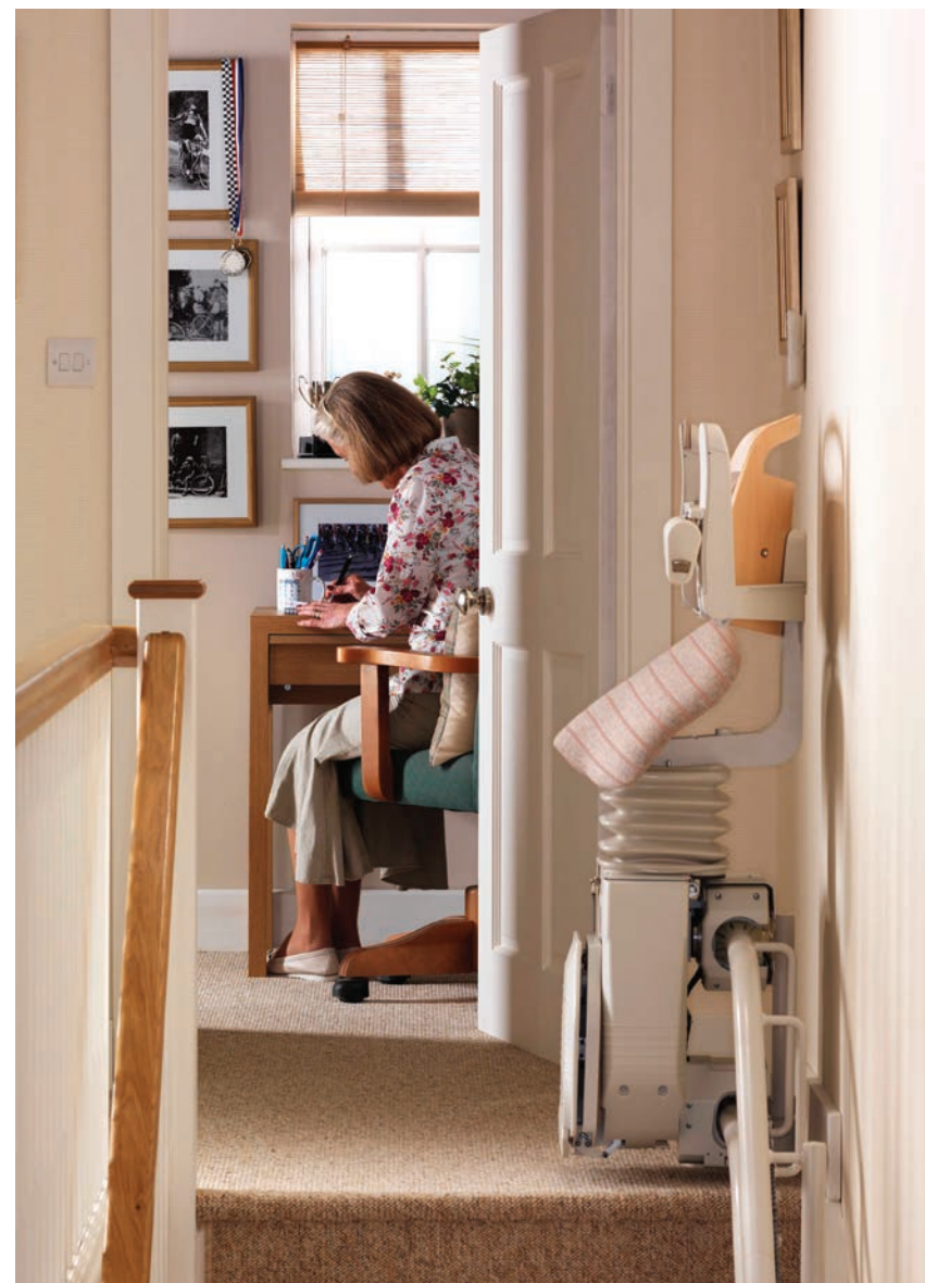
The Sadler's slimline design allows others to still use the stairs

The elegant Sadler is crafted for choice and ease-of-use in every way, with the chair folding away for a compact footprint allowing other people to continue to use the stairs. It's this level of thought and care that ensures that Sadler is the natural choice.