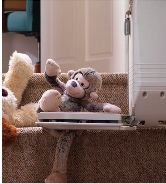
Sensors detect obstructions on your stairs