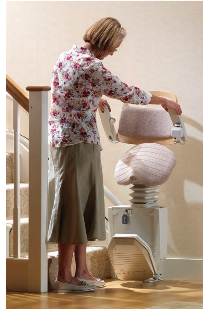
Fold the arms and the footrest folds automatically

“We are delighted with the stairlift. My wife enjoys the ride. It gives her independence. She finds it very easy to use”